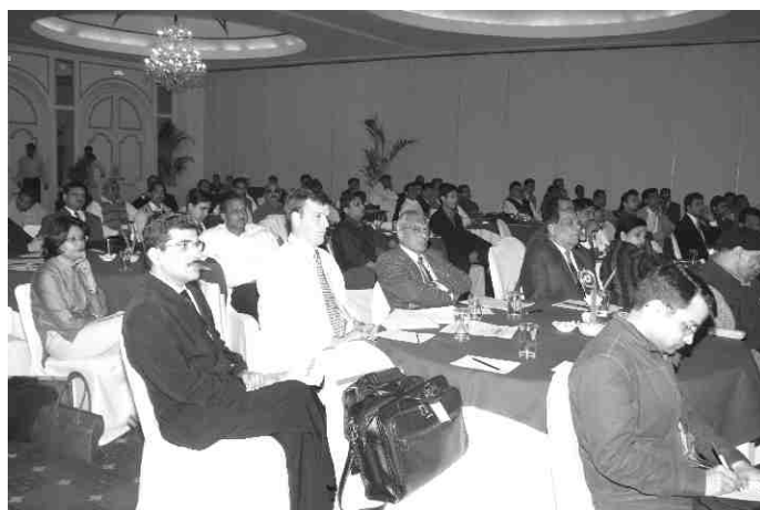
A View of Participants at the workshop

industries and prospective entrepreneurs, administrators and planners, scientists and technologists, marketing and nutrition specialists and exporters to come together to consider, debate and chalk out the strategies in view of domestic and global changes taking place and to submit recommendations on the same to the Government of India.